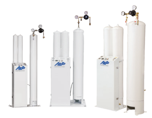
AS-A, AS-B and AS-D Mini Pack Generators